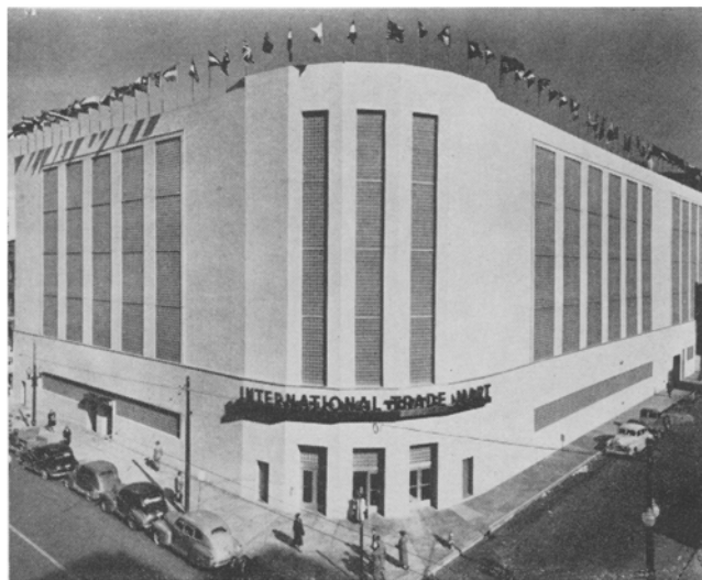
International Trade Mart, New Orleans